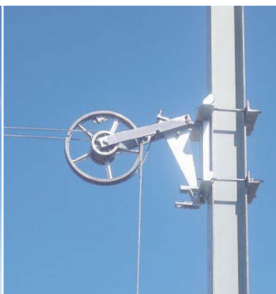
◀ RIBE® tension wheel with integrated cable brake - For smooth braking